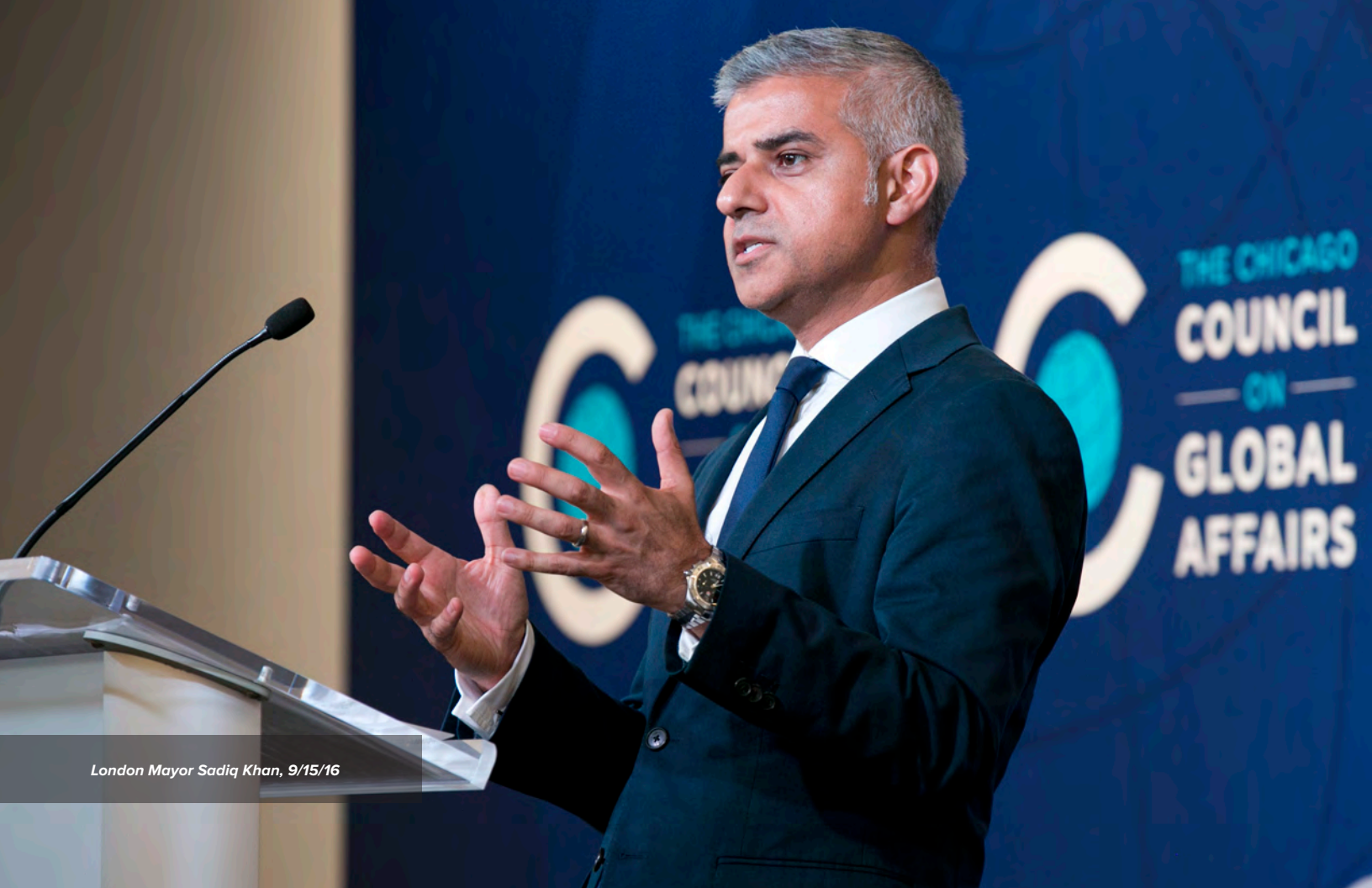
London Mayor Sadiq Khan, 9/15/16